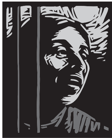
Prepare a way for the Lord

A s we prepare to celebrate the Lord's 'coming' at Christmas, our Advent liturgies invite us to a fuller appreciation of the great plan of God – a plan that will reach its climax with the inauguration of God's final Kingdom, in the 'second coming' of the Saviour. We read again from the final chapters of the Book of Isaiah. This amazing passage helps us to understand the wonder and joy with which the apostolic generation read the texts of the Old Testament, and recognised that they had been fulfilled in Jesus Christ. Their faith in Christ, they proclaimed, was 'according to the Scriptures' (Lk 24.27; 1 Cor 15.4 etc.) In this passage, the message of God's generous ways already finds a sublime and inspiring expression: 'Console my people, console them, speak to their hearts'; let the 'joyful messenger' proclaim God's presence in their midst; God will lead the exiled people home through the wilderness, in a new Exodus; Israel's God will be 'like a shepherd feeding his flock, gathering the lambs in his arms'.