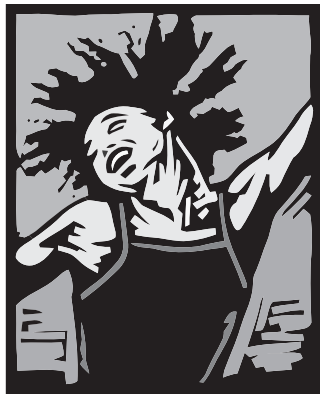
'Your body, you know, is the temple of the Holy Spirit'

A fter his baptism in the Jordan, Jesus set out on his great mission. Throughout this year, we follow the course of his mission in readings from the gospel of Mark. The gospel readings of this Sunday (from John) and next Sunday (from Mark) invite us to set out on this journey of discovery as disciples of the Lord. Just as he called the first disciples, the Saviour has a personal call for each one of us to become his 'disciple'. The recovery of the long neglected them of 'discipleship' is one of the signs of new vitality on today's Church. The word, 'disciple', occurs many times in the New Testament. Why was it so important for the first Christians? Discipleship, the privileged relationship one can have with a great and inspiring leader, has been an important factor in the shaping of human history. The leader's vision and commitment call forth admiration and confidence – the lives of their followers are changed, and they face life with a new inspiration and hope. Clearly, those who made up the communities of the New Testament experienced this kind of relationship with the Risen Lord. Today's reading from John's gospel helps us to understand how we too can have this kind of relationship with the Saviour.