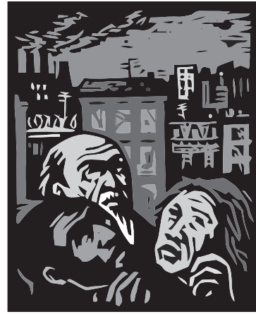
Tear the heavens open and come down

During the coming year, our gospel readings will be from Mark. Today's reading recalls a parable of Jesus, urging constant readiness for his return. We have no way of knowing how the end will come upon us. But the first 'Coming' of the Saviour – as truly one of us, born like us and sharing in what we all experience – makes it clear that we can look forward to the final 'Coming' with confidence.