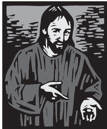
Give back to Caesar what belongs to Caesar