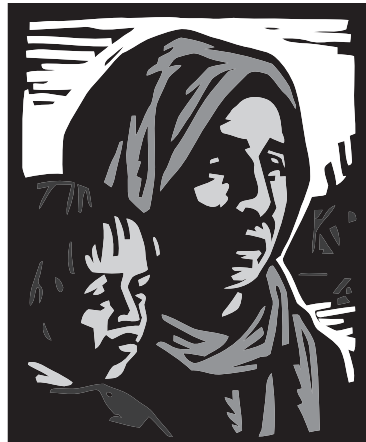
Come to the wedding

Matthew's account includes the note of urgency characteristic of the outlook of the first Christians - three times, the king declares that all is 'ready'. The final age has come, all must be ready to respond to the Lord's call. And so, along the same lines, Matthew concludes his presentation by adding the short parable about 'the man without a wedding garment' - that would originally have been quite independent of the original story. Again the lesson is clear: although, in the present age, Matthew's Church receives 'the good and bad alike' to rejoice at the wedding feast of the Lamb, let them know that their presence must be more than nominal adherence - they must be converted and live a life worthy of their calling.