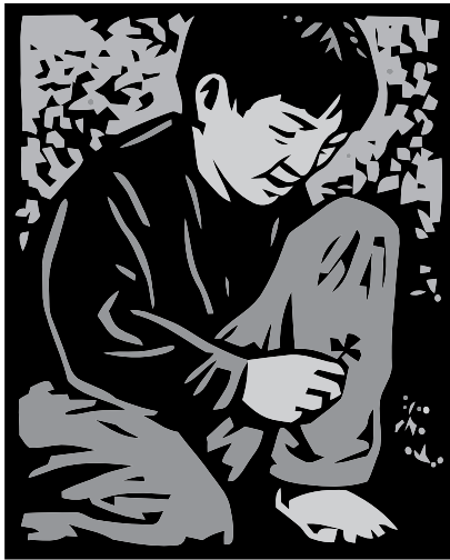
Everything the Father has is mine

The ultimate mystery of God's life is – not surprisingly – far beyond our complete comprehension. It would be tragic, however, if it remained for us no more than a daunting abstraction. Christian faith should bring us the joy of recognising that – in the overflowing tumult of the divine life that we call the BLESSED TRINITY – we find three friends who invite us to share in their common life as the ONE TRUE GOD. Today's gospel from John expresses this sharing in simple terms, and it brings us this astounding invitation: the Spirit 'will lead us to the complete truth', since he shares all with the Son, who in turn shares in 'everything the Father has'.