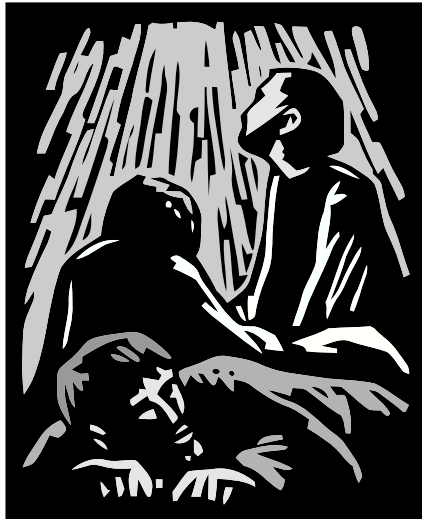
They were speaking of the passing which he was to accomplish in Jerusalem

Each year of the three-year cycle, the gospel of the second Sunday of Lent tells of the Transfiguration. This year we have Luke's account which presents this incident as Jesus instructs his disciples – preparing them for his journey to Jerusalem to meet his fate. The liturgical tradition echoes this outlook, inviting us to learn the lessons of this mysterious incident as we begin our journey of Lent. In Luke's account, in the verses immediately preceding, Jesus has warned the apostles of what lies ahead: "The Son of Man will be rejected and put to death; more than that, everyone who wants to be his follower 'must take up his cross every day and follow him' (9.22-23). Luke's account clearly has these warnings in mind. It is filled with reassurance for the chosen followers Jesus has brought up the mountain with him. Moses and Elijah (representing the Law and the Prophets, the great bearers of old Israel's hopes) are conversing with Jesus concerning 'his passing which he was to accomplish in Jerusalem' (the destiny of Israel was established in the original Passover and Exodus; in what lies ahead, this great destiny is to reach its final moment – as the shadows of the old order give way to the reality they prefigure, the Paschal Mystery). From the 'cloud', so often a symbol of God's presence in the first Exodus, the voice of the Father confirms what Jesus has told them of this new Passover: "This is my Son, the Chosen One. Listen to him."