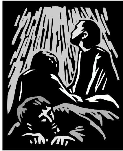
They were speaking of the passing which he was to accomplish in Jerusalem

Each year of the three-year cycle, the gospel of the second Sunday of Lent tells of the Transfiguration. This year we have Luke's account which presents this incident as Jesus instructs his disciples – preparing them for his journey to Jerusalem to meet his fate. The liturgical tradition echoes this outlook, inviting us to learn the lessons of this mysterious incident as we begin our journey of Lent. In Luke's account, in the verses immediately preceding, Jesus has warned the apostles of what lies ahead: "The Son of Man will be rejected and put to death; more than that, everyone who wants to be his follower 'must take up his cross every day and follow him' (9.22-23). Luke's account clearly has these warnings in mind. It is filled with reassurance for the chosen followers Jesus has brought up the mountain with him. Moses and Elijah (representing the Law and the Prophets, the great bearers of old Israel's hopes) are conversing with Jesus concerning 'his passing which he was to accomplish in Jerusalem' (the destiny of Israel was established in the original Passover and Exodus; in what lies ahead, this great destiny is to reach its final moment – as the shadows of the old order give way to the reality they prefigure, the Paschal Mystery). From the 'cloud', so often a symbol of God's presence in the first Exodus, the voice of the Father confirms what Jesus has told them of this new Passover: "This is my Son, the Chosen One. Listen to him."