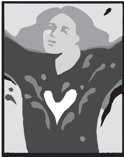
He will baptize you with the Holy Spirit and with fire