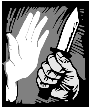
God did not spare his own Son

The testing of Abraham is one of the masterpieces of the Old Testament. The story echoes a brutal age in which the sacrifice of children was not uncommon – in fact, the people of the old Israel were taught to sacrifice an animal in place of their offspring, to turn them away from this horrendous temptation.