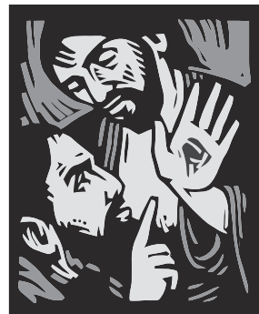
A celebration of Easter faith

This gospel invites us to share the experience of the disciples, finding faith through the coming of the Lord into their midst on the evening of his Resurrection Day. What a dramatic situation – they are to meet the one whom they have deserted and abandoned to his fate. There is no word of reproach, no reference to what has taken place, only 'Peace be with you' and again 'Peace be with you' – you are forgiven, come once more into my friendship. Their finding faith is a meeting with God's generous and reconciling love. And he sends them forth with the good news of the forgiveness of sins.