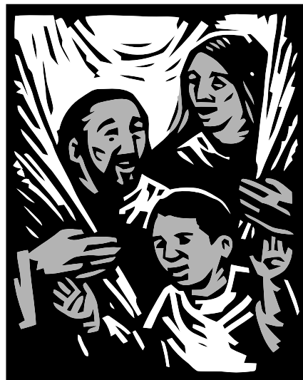
All humanity will see the salvation of God

Last Sunday, the liturgy invited us to see Advent as a time of preparation for the Saviour's birth, the dawn of salvation. Today we take up this theme again, in the gospel reading from Luke. John the Baptist is a prominent figure in the liturgies of Advent. After a long period in which the voice of the prophets was not heard, the Lord's Precursor – praised by Jesus as 'more than a prophet' (Mt 11:9) – made his appearance. Luke's introducing of John is dramatic and skilful. Situating John's heralding in the midst of the real world's history, he names contemporaries who foreshadow the tragic conflict that is soon to be enacted – Pilate who will authorize Christ's death, the petty rulers of the nation under occupation, the high priests whose hostility seals the fate of Jesus. But the gloom of this introduction gives way immediately to the vision of hope and promise that inspired John's mission. The Baptist – remembered as a man of the desert – is presented as inaugurating a new Exodus for God's people, as foretold by the prophet Isaiah.