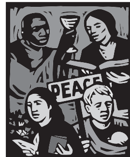
New life in the Spirit of Christ

Luke's story of the Church's first Pentecost is an example of this approach. The Church's first courageous witness, and its subsequent announcing of the Good News throughout the known world, was a remarkable fulfilment of the Saviour's promise that he would give his disciples courage and power through the gift of his own Spirit (Mk 13.9-11). The universality of the Church's mission is made clear. The Church's first witness is to 'devout people from every nation' - in the first place to 'Jews', but with the mention of 'proselytes' among the crowd addressed the conversion of the gentiles is also anticipated. In the continuation of our passage, Peter's sermon gives a summary of the Church's early witness.