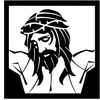
The Son of Man must be lifted up, so that we may have eternal life in Him

In our disappointment with our lives, the darkness seems so real and overwhelming. The first reading, telling the story of old Israel – a story of unfaithfulness, stubborn selfishness, destruction and exile – reminds us how often human history has been filled with darkness, right down to our own day. In the second reading from the letter to the Ephesians, Paul confidently confronts this darkness: for him reliance upon false and selfish securities is to embrace 'death'.