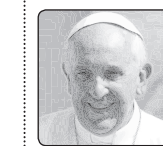
Pope Francis @Pontifex Vatican City news.va Joined February 2012