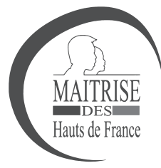
Petits Chanteurs de Lambersart