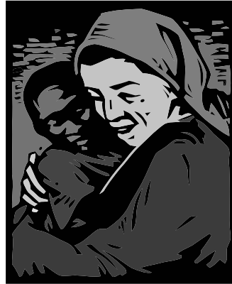
Anyone who loses his life for my sake will find it

In last week's gospel reading, Matthew celebrated Peter's commission as the guardian of unity in the Church. The continuation of that passage, in today's reading, recalls the rebuke Peter received from Jesus after his confession. It was the mission of Jesus, to fulfil all the expectations of the Old Testament. In the questions put to the disciples that led to Peter's confession, Jesus speaks of himself as the 'Son of Man', and he repeats this reference in the concluding words of today's reading. The 'Son of Man' was the triumphant figure of the book of Daniel who was to come on the clouds to establish God's universal reign. Now, in the first of three predictions of his passion, he identifies himself with the 'Servant' of the Isaian writings who, by his sufferings, would lead God's people to the fulfilment of their God-given destiny. These references would have been treasured by Matthew's community, as they recalled their great theme that the life and death of the Saviour took place 'to fulfil the scriptures'. In Peter's condescending response to Jesus' prediction of the outcome of his rejection by the leaders in Jerusalem - 'This must not happen to you' - we glimpse something of the trusting relationship Jesus maintained with his disciples. But the sharp reaction of Jesus makes clear the seriousness of Peter's mistake. There is a great irony in the rebuke of Jesus: the 'rock' is told that he is a 'stumbling block'.