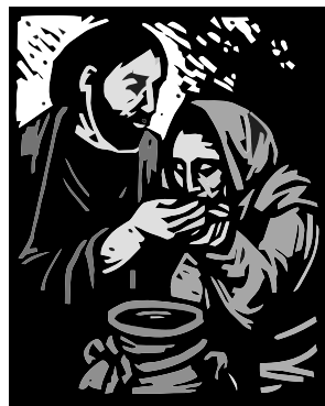
Anyone who drinks the water I shall give will never thirst

This lesson is hammered home for them – and for us – in the words of Jesus to his bewildered disciples: 'My food is to do the will of the one who sent me'; the harvest is 'ready' – 'grain for eternal life'. His final lesson is a call to humility – the saving plan he is inaugurating is God's work – among God's workers, 'one sows, another reaps'